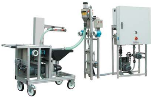
DYNAMIX H with spreader ECOTOP 350