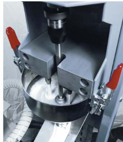
Dynamic mixer at work